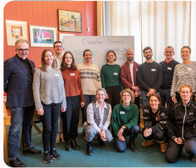
Circular Roundtable participants after the final visioning session

The circular community of Lund has been growing and we had several fruitful collaborations and exchanges throughout 2023. A special effort coordinated by our 2022 and 2023 External Relations officers was the Circular Roundtable , an event co-hosted by Circle Centre and Lunds Kommun to foster dialogue and collaboration across actors and organisations active in the circular economy in Lund. The event saw representatives from AF Bostäder , Fritidsbanken , Renhållningsverket , Lund University, Återbrukarna , Lunds Kommun, Circle Centre, Folk & Frö and Repair Café Malmö come together and discuss opportunities and challenges for circularity in Lund.