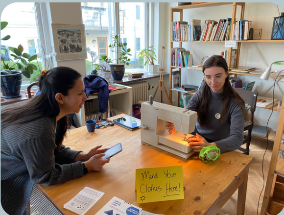
Our mending table during the Secondhand Fashion Show event

On International Repair Day in October we organised a skill sharing repair event with Hållbart Universitet . The idea was to bring your own clothes or non-electronic items and learn how to repair them, or alternatively help us repair Circle Centre items. Later that day, one of our officers hosted a workshop on how to create a no waste pumpkin from scrap fabric. The event attracted a lot of our community members and provided a sustainable alternative for a Halloween pumpkin tradition!