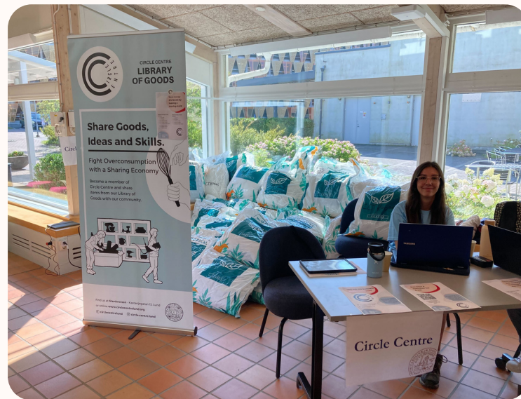
Circle Centre at the LU Arrival Days 2023, with our bedding kits

Lund University is another of our closest and most valuable partners. In 2023, Circle Centre was invited to participate in the LU Arrival Days once again, offering students the opportunity to kickstart their student life in Lund sustainably by borrowing one of our bedding kits. This would not have been possible without the help and resources offered by LU and its Division of External Relations . The Lund University International Desk has also been supporting us by informing international students about Circle Centre. We are grateful for the support received and excited to collaborate more in the future!